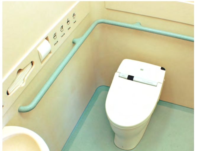
The Grifform Innovations® Handicap Rail is made of DuPont™ Corian® and is totally seamless. It is durable and will not support the growth of microorganisms, and is attached using concealed hardware. The rails are available with slip resistant surface for an added safety feature.