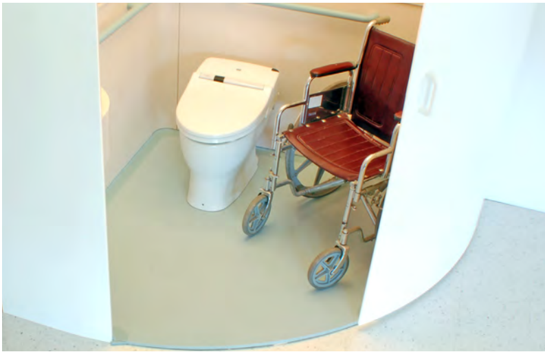
The Grifform Innovations® Bath Pod has a low threshold entrance and ample room, making it meet the intent of the ADA rulings.