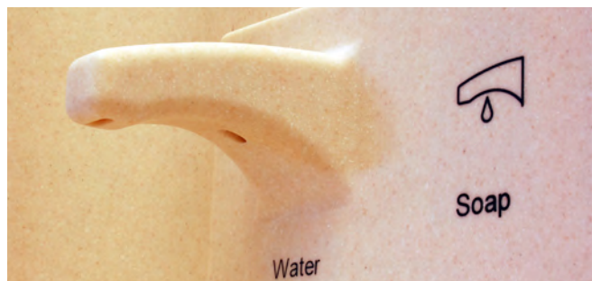
The Grifform Innovations® Bath Pod controls for lights, water, soap, and toilet are made of DuPont™ Corian® and are all hands free applications, which help maintain the sanitary conditions. Grifform® is also providing water faucet stems that have the added value of a built-in soap dispenser.