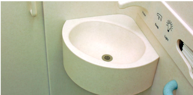
The Grifform Innovations® lavatory is made of DuPont™ Corian®. It is completely seamless which aids in maintaining a sanitary environment. It resists stains and is easy to clean. The lavatory bowl and apron are all monolithic and provide easy care in a wide color pallet.