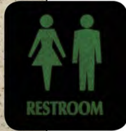
Glow In The Dark